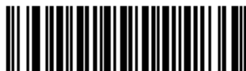
No Preamble (<DATA> (0)

To disable the country code, AND to disable the leading digit for UPC-A, scan: